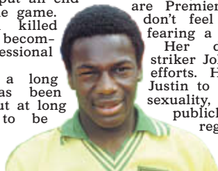
Death... Justin Fashanu